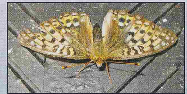
A Dark Green Fritillary Butterfly at Finzean Sawmill last August.