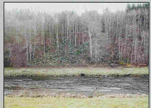
A view across the Dee into Slewdrum Forest, looking at one of the five small sites along the river banks where BCT removed stands of non-native conifers this winter to encourage native broadleaved woodland.

covers over 125 sq.kms. (50 sq.mls.) of Mid Deeside. The four main parts of the parish are the three local communities of Finzean, Ballogie and Birse and the largely uninhabited Forest of Birse. The total population is nearly 750 in around 280 households, with half of the parish's population and households in Finzean.