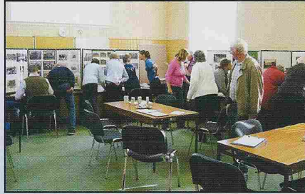
One of the exhibitions that were held during 2009 of old photos from BCT's Archive.

BCT has also reviewed its local wildlife records against the priority habitats and species in the Cairngorms Biodiversity Plan that occur or may occur in Birse parish. BCT will be following this up by consulting over the habitats and species on which BCT should focus future survey work.