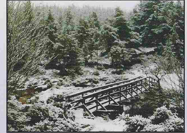
A recently donated photo that dates from the early 1990s and shows the bridge that used to cross the Feugh at the Laird's Burn upstream from the Bucket Mill.