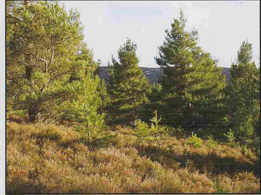
Commonty Pinewoods: A recent survey has shown that the area of native pine woodland in the Commonty has increased by 15% since BCT's first survey ten years ago. The expansion has all taken place by a gradual process of natural regeneration as illustrated by the photo. The woodland would have expanded by over 25% if it had not been for the destruction caused by the major wildfire in 2003. During the last ten years, BCT has supplemented the natural regeneration of the pine by planting over 15,000 native broadleaves to restore these species as part of the pinewood.

This strategic vision of the parish's three community forests supporting other important sites and local community development more generally, will only be secured if BCT can become the owner of Balfour Wood. BCT had hoped to achieve that this spring, but this has been prevented by the lack of Lottery funding. While that has been a setback, BCT remains determined to find another way to acquire the Wood. In setting off on that quest, Trustees were able to recall that it took nearly four years to secure the ancient rights over the Forest of Birse Commonty and over six years for BCT to be able to buy Slewdrum!