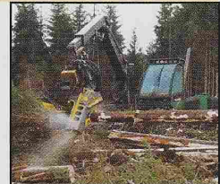
Balfour Wood: During the winter, BCT cleared the windblown sitka spruce trees beside the Church Road in Balfour. BCT and FC Scotland are now planning to improve the condition of this important path at that location.