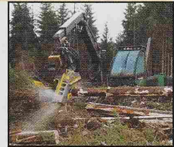
Balfour Wood: During the winter, BCT cleared the windblown sitka spruce trees beside the Church Road in Balfour. BCT and FC Scotland are now planning to improve the condition of this important path at that location.