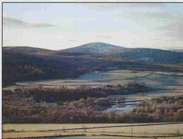
A view south-west from Balnacraig to Kinminity Farm, Balfour Wood and the summit of Carnferg, with the start of Balfour Wood marked by the pale larches running across the photo.

The purchase of Balfour Wood will be an historic achievement for the community that will bring major local benefits in the years ahead ( see Chairman's Comment on page 4 ).