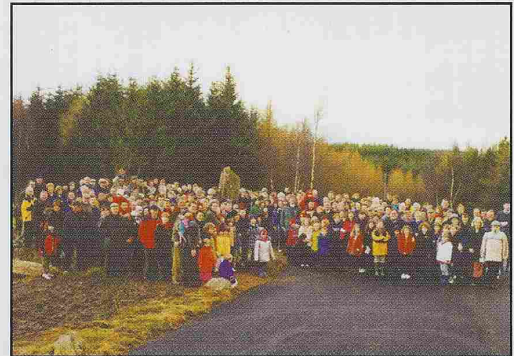
The Dedication of the Birse Millennium Stone at Corsedardar on 1st January 2000