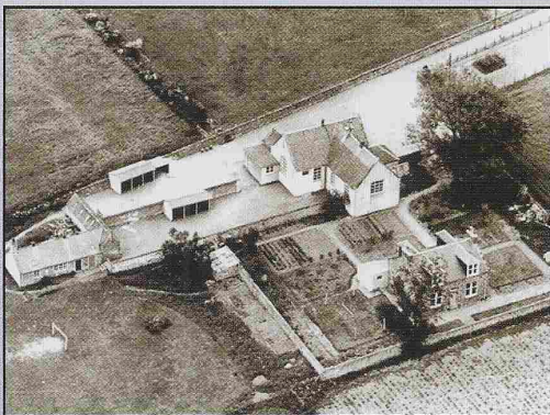
Finzean School in the 1950s