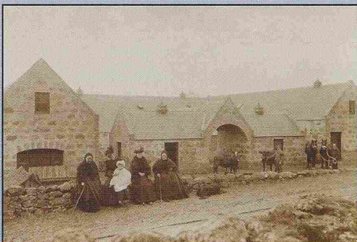
Waterside of Birse in 1897