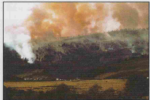
The major wildfire in the Forest of Birse Commonly Pinewoods on 10th April 2003