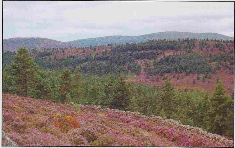
This area of expanding native pinewood in Birse parish includes areas managed by Finzean Estate, Ballogie Estate and BCT respectively.

In the coming weeks, BCT plans to thin the trees on the south side of Forest of Birse road just before the road reaches the Forest of Birse Kirk car park. This