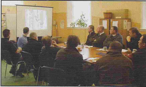
This year's local meeting at Finzean Old School about management to conserve capercaillie in Birse parish.