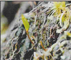
A seed pod of the Green Shield Moss. This rare moss, which has the same European conservation status as capercaillie, was found recently in Quithel Wood.

BCT carries out many different types of projects to conserve and enhance the natural heritage of Birse. These cover both the sites where BCT is directly involved and the wider parish.