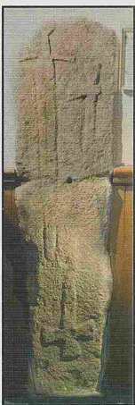
The Crusader Stone in Birse Kirk.

Birse Kirk is one of the parish's most historic sites. The first documentary record of it is in a charter over 800 years ago and it is believed to have been one of the first Christian sites on Deeside before that. BCT has just completed a research project to locate and compile information about the history of the Kirk and plans to publish the results. BCT has also recently produced a comprehensive illustrated catalogue of the contents of the Kirk, including photographs of many of the items gifted to it or bought for it by the Congregation.