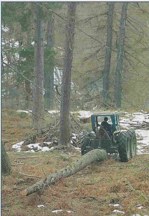
Timber for the Mills being extracted recently from the Commonly Pinewoods.

At the same time, the Ecumenical Trust for Birse Kirk, which leases the Kirk from BCT, continues to make very positive progress in its conservation and use of this historic church.