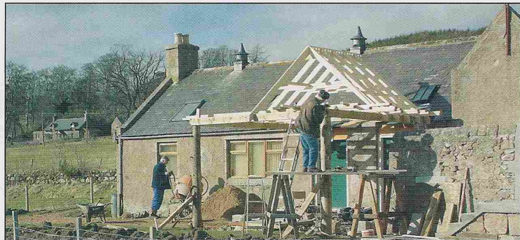
Doug Gray and Ian Hector building the new porch on the former Soup Kitchen.

BCT has been carrying out repairs and improvements to the Old School buildings since it became owner of the site just over a year ago. The re-harling of parts of the main building and the former toilet block (now BCT's environmentally controlled archive) has been completed. The major project now is building a porch on to the Soup Kitchen. This will mean that the main room no longer opens straight to the outside and that the toilet can also be reached without going outside.