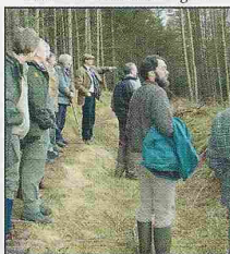
One of the Site Visits.

BCT's work on capercaillie conservation is just one of the projects of BCT's Natural Heritage Group. If you would like to be involved, please contact the BCT office.