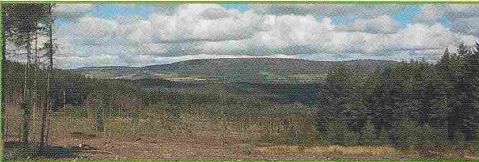
The view from the Shooting Greens Road across the Dee towards the Hill of Fare.

The major felling along the south side of Slewdrum Forest reported in the last newsletter, has been completed and the next phase of work is about to start between the two hills in the Forest, Little Ord and Meikle Ord. While the immediate aftermath of such extensive fellings is very unattractive, there are now panoramic views from the Shooting Greens road eastwards across the Dee to the Hill of Fare and over time, there will be substantial environmental benefits as the felled areas are regenerated as native broadleaved woodland.