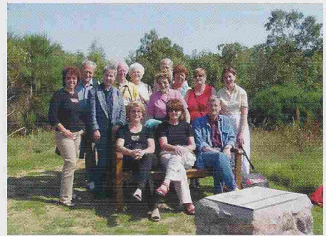
The Interskola group during their visit to BCT.