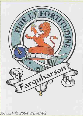
Artwork © 2004 WB-AMG