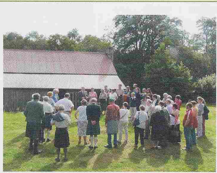
Members of the Clan Farquharson visit The Bucket Mill