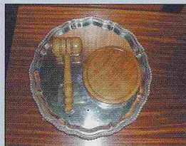
BCT's gavel on the silver salver BCT won in the 2002 Scotland's Finest Woods Competition.