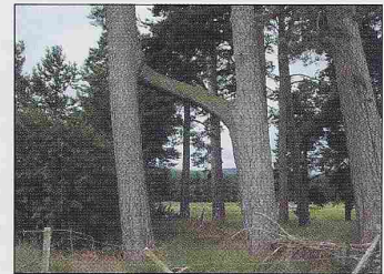
The Twin Trees of Finzean.

The other heritage tree is actually two trees – the Twin Trees of Finzean. The way in which a branch from one pine tree has grown into another is a natural curiosity. The trees are over 100 years old and have long attracted attention. BCT has a 1950s postcard of the trees in its Local History Archive.