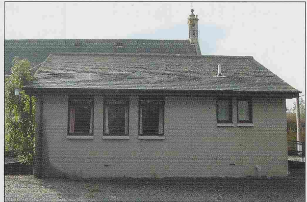
Birse Church Hall viewed from the north with Birse Church behind.