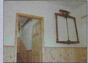
The entrance to BCT's Local History Archive, in contrast to the building work shown in Update 6. Two donations are displayed on the wall – a peat spade and a pit saw.

In addition to BCT's cultural heritage projects based directly on the sites it manages, BCT has an expanding number of parish wide projects. BCT has reprinted three local history books so far and started projects on local place names, traditional routes, the music, songs and poems of Birse, local family history records and other topics. BCT is also developing the collection of interesting documents and other items that have already been donated to its Local History Archive at Finzean Old School.