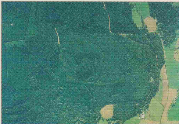
An aerial view of Balfour Wood before the Allansack Burn clearfell in 2000. The Newmill fields are in the top right and those around Balfour House in the bottom middle.

In 2000, BCT and Forest Enterprise signed a pioneering long term agreement to manage Balfour Wood jointly 'to maximise the economic, social and environmental benefits to the inhabitants of Birse from the sustainable management of the Wood'. A similar agreement was signed over Slewdrum Forest in 2001. A wide range of improvements are now being carried out at both sites for local benefit. There are particularly strong community associations with Slewdrum Forest as it was a local common until the 1950s and BCT hopes eventually to own the site on behalf of the community.