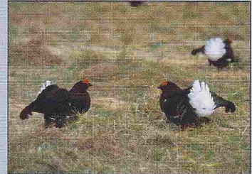
Blackcock at one of several leks in the Forest of Birse Community.

BCT is implementing a three year parish wide natural heritage programme as part of developing its work to conserve and enhance the environmental value of the sites it manages. The programme includes compiling a database of local wildlife records, carrying out habitat surveys and studies of particular species and raising awareness of the parish's wildlife. BCT also has a separate project on the parish's Rivers and Burns.