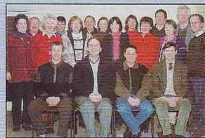
BCT hosted the first ever meeting involving the committees of all three Community Associations in the parish.

As one of its range of initiatives to promote community development locally, BCT is undertaking a pilot community planning project. This involves consulting local residents for their views on a range of issues,