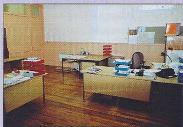
One of the refurbished classrooms that BCT has made available as office units for other local businesses.

It has been a tremendous boost for BCT to have its own office, not least because more people have been able to become involved in helping with the Trust's work. BCT also now has an expanding range of office equipment that members of the community can come and use including a photocopier, an A3 colour printer, a scanner, e-mail, a laminator and report binder. The office is open most week days 10am - 2pm, but it