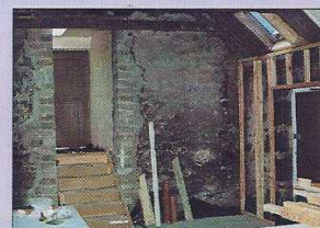
The new link between the areas that will be BCT's project room (former soup kitchen) and archive store (former toilet block).

If you would like to see any of these collections or if you have items you might like to donate, please contact Sandra Holt at the BCT office (01330.850200).