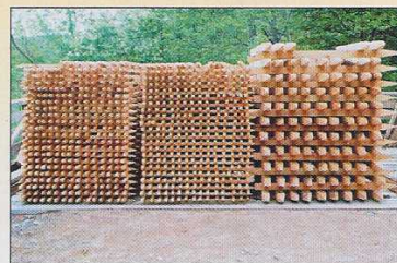
Stakes and posts at Finzean Sawmill

Finzean Water Mills: While the re-cladding of the Bucket Mill roof and repair of the mill's main drive drum were delayed until 2002, work continued at the Sawmill. Most of the European larch felled by the Trust in the Commony Pinewoods, has now been cut at the mill into timber for use on BCT projects, including wooden framing for the Old School building work (see photo above). BCT also has additional stakes and posts that are available for sale - for more details contact BCT's office.