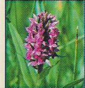
An Early Purple Orchid (top) and Northern Marsh Orchid, in Slewdrum Forest.