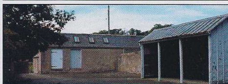
The 'cookhouse' that will become BCT's project base (above left).