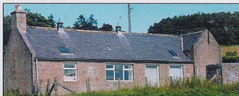
The main Old School building where BCT will have its office (far left).