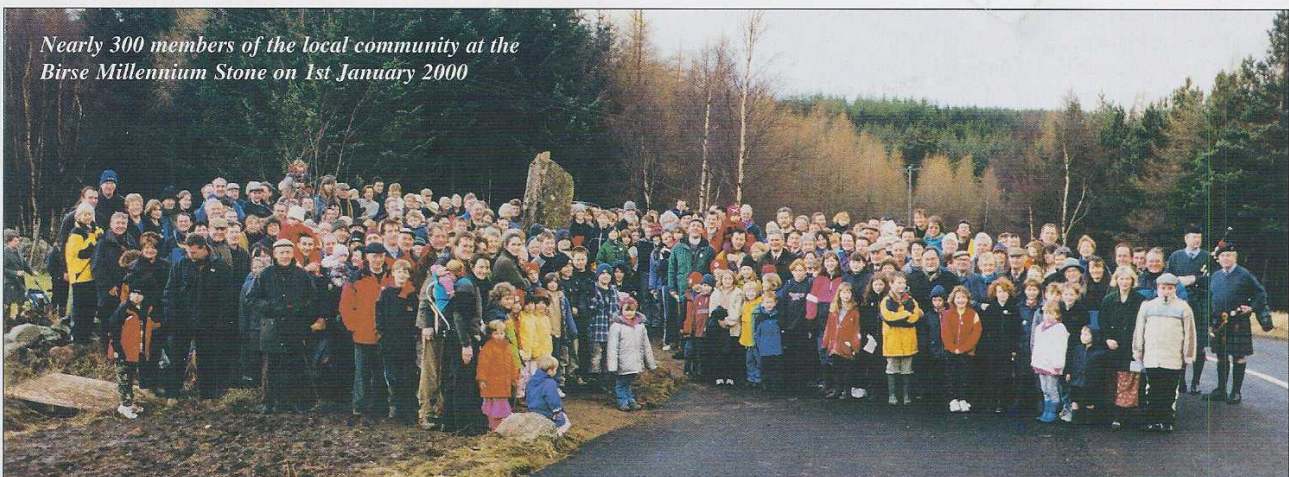
Nearly 300 members of the local community at the Birse Millennium Stone on 1st January 2000