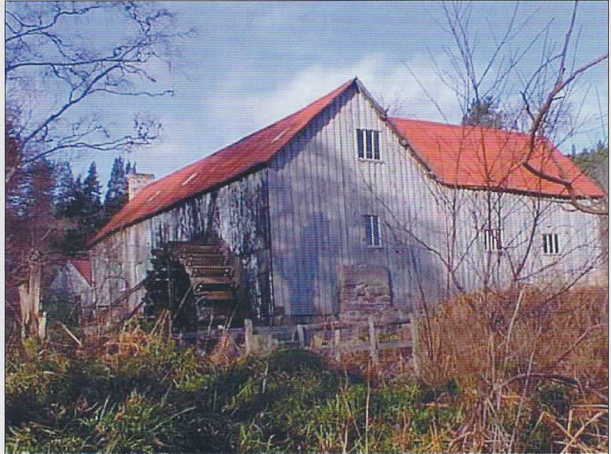
The Finzean Bucket Mill with its 13 foot diameter water wheel.

The survival of these historic mills over recent decades has been a major achievement by David Duncan, Stan Moyes, Finzean Estate and everyone who has helped them. However, the future of each of the Mills and of the Finzean Water Mills Trust, which was originally set up in 1991 to support the Bucket Mill, has become increasingly uncertain over the last few years. Significant funding is needed to maintain both the physical condition and continued operation of the mills, as dramatically illustrated by the collapse of a major retaining wall at the Sawmill last year.